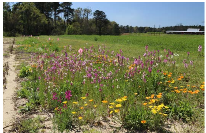
Border plot at Attagulgus Research and Education Center containing a mixture of Southeast specific wildflowers.

Our key goal of this research is to design cost-effective methods for increasing season long habitat areas to promote natural ecosystem services that would lead to sustainable pest management and improved species diversity.