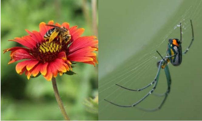
Examples of beneficial arthropods: left - native bee, Eucerini; right - orchard spider, Leucauge sp.

The questions that many ask are where to place provision areas in the farm, and what to plant? For instance, an inexpensive way to develop a provisioning area is to reduce mowing and disturbance around field margins 1 and or plant certain types of native plants that attract beneficial arthropods 2 .