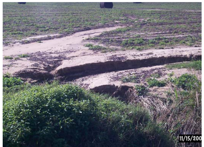
Leaving the soil bare during the winter months allows the rain to carry soil off of the field.

I expect many of you have heard that a good steady rain over a long time period is better than a heavy rain over a short period. One way to visualize this is to think of a dry sponge. Take a sponge, hold it flat and allow water from the faucet to drip onto it for a short period of time. Now take a second sponge and turn the faucet on all the way. What happens? I expect the drip on the sponge allowed the water to soak in, whereas the open faucet caused most of the water to runoff. The soil acts the same way, a slow steady rain typically will soak into the soil whereas a heavy rain runs off. One thing we learn at an early age is that water moves downhill. When it rains, if the soil does not absorb the water, it will flow downhill to lower elevations and can carry pollutants. These pollutants can be the fertilizer applied to grow crops or grass. They can be chemicals to kill weeds or bugs. They can be bacteria from applied or deposited manure. It can also be the soil itself in the form of sediments. When these pollutants runoff the land into drains, gutters, creeks or ponds, we call this non-point source pollution.