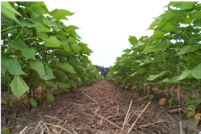
Cover crops in a farmer's field is similar to applying pine straw mulch to a flower bed.

of the practices you have more than likely seen is the use of cover crops. During the fallow times of the year, typically winter, farmers will plant cereal rye, clover, or a mixture of seeds. As the seeds germinate and the plants grow they cover the soil and protect it from the energy of the raindrops. To visualize how these cover crops work, think of the last time you were caught in a rainstorm, or try it in the next rainstorm. What hurts more, a raindrop hitting your skin or a raindrop hitting a coat sleeve? The coat sleeve acts like the cover crop in the field, it absorbs the energy of the raindrop and protects the soil, just like the coat protects your arm. Once the energy is absorbed, the water can gently run down the plant and onto the ground where it can soak into the soil. When the plants die in the spring, the plants are not removed from the soil, but rather are allowed to fall or are rolled down to form a mulch in the field similar to adding pine straw to flower beds.