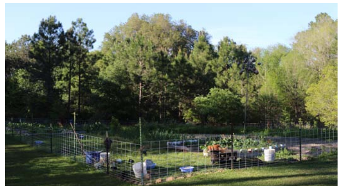
Small farm in Tifton, GA managed by Bret Wagenhorst containing a diversity of fruit and vegetable crops.

Non-crop areas of the farm that provide additional habitat for arthropod communities are key to maintaining a healthy and sustainable agricultural system. Non-crop habitat patches are known as “provisioning areas” because they provide sources of food or refuge for beneficial organisms such as pollinators and biological control agents. Maintaining and developing provisioning areas in the farm increases biodiversity of pollinators and biological control agents. More diverse farming systems net higher levels of these natural services such as pollination and biological control. Strategic planning for crop production, includes planning for provisioning areas early in the season. Integrating habitat provisioning into crop design also adds beauty to the garden or landscape.